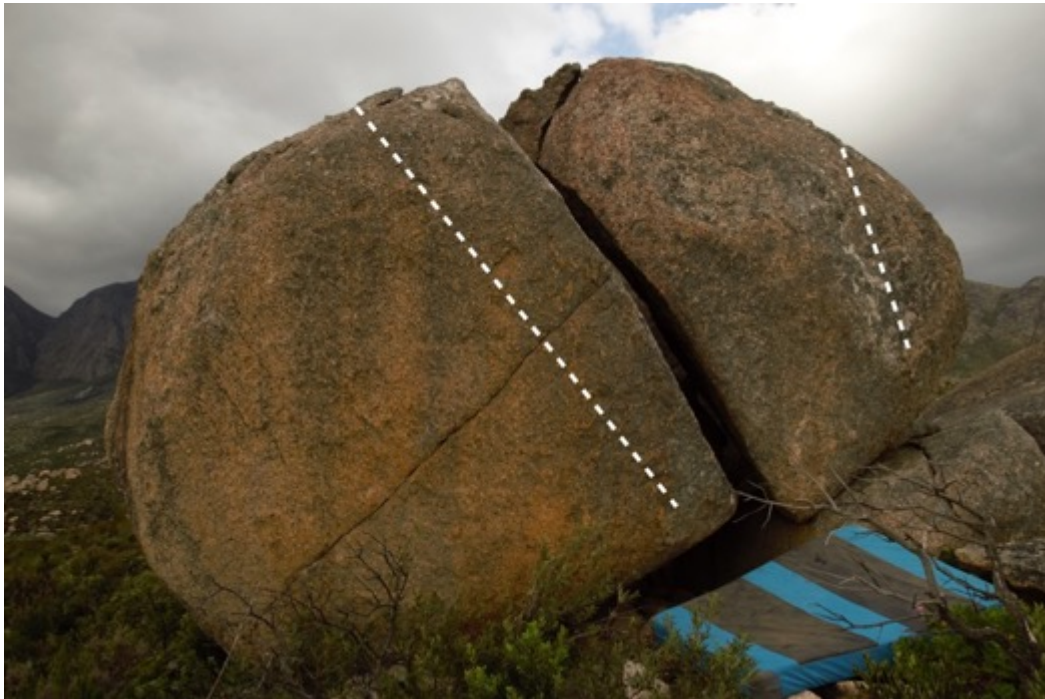
Photo 6. Cracked Egg Boulder. Eggcellent (left), Brake Fast (right)